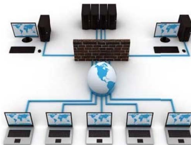
Secured Computer Network Design